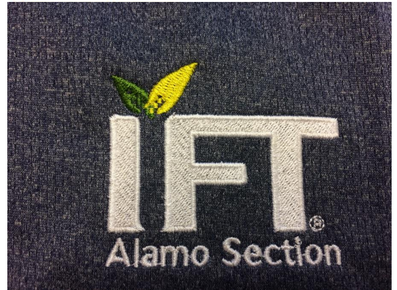
Sample of logo